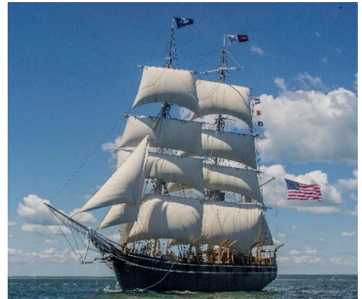
The Charles W. Morgan

There is perhaps no better place to begin than at the Mystic Seaport Museum, the nation's leading maritime museum, founded in 1929. Mystic is home to four National Historic Landmark vessels, including, America's oldest commercial ship and the last wooden whaleship in the world, the Charles W. Morgan . You will tour the type of ship that carried millions of pieces of transferware from the UK to America in the nineteenth century. The museum's curatorial staff will discuss the small but select transferware collection and guide us on a tour of the recreated 19 th century seaside village and of the Morgan itself. While in Mystic, Dr. Ewins will deliver the first of two lectures at the museum.