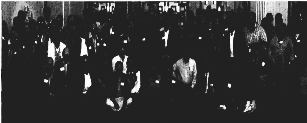
The entire group together at the Third Annual Meeting, 2002!

Our third annual meeting welcomed members from all over the US and Great Britain. Over 100 members attended, our largest meeting to date.