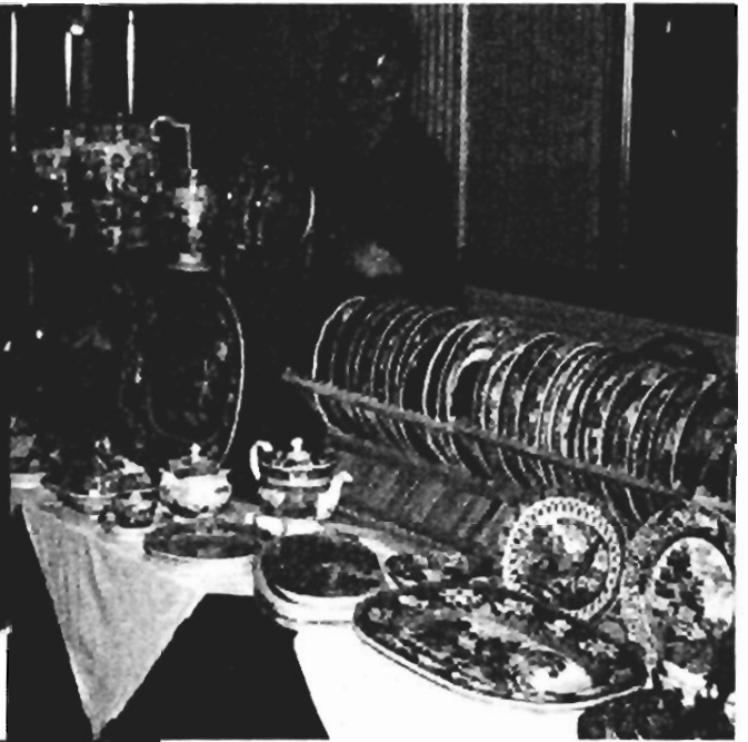
Dora Landey with a beautiful selection of blue transferware!