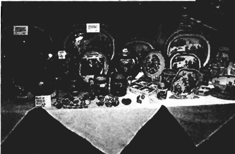
Rita Cohen showing early blue chinoiserie.