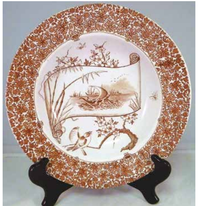
FIGURE 8: 9 3/4" Cairo soup bowl.