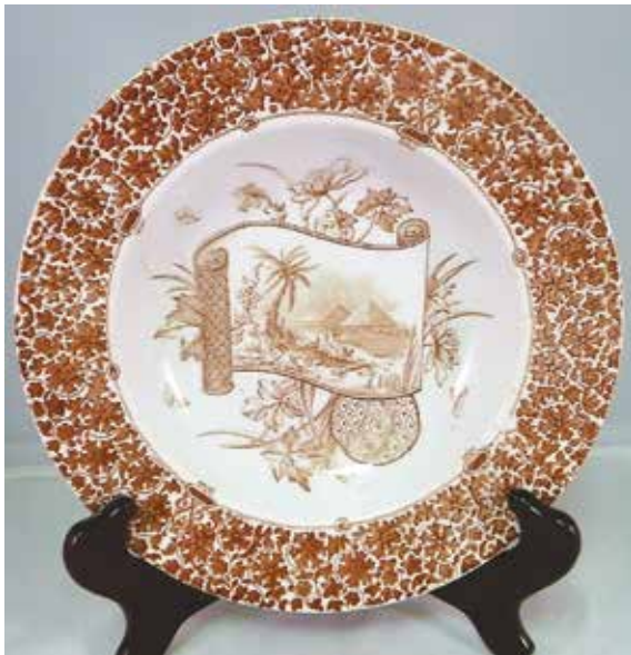
FIGURE 9: Small 8 1/2" Cairo soup bowl.

Editor's Note: There are currently 11 patterns from this series recorded in the TCC Pattern and Source Print Database.