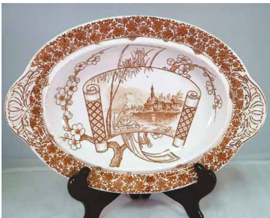
FIGURE 2: 10" Cairo platter.