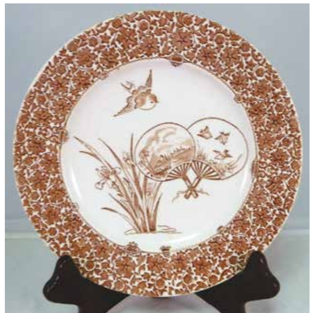
FIGURE 6: 8 3/4" Cairo dessert plate.