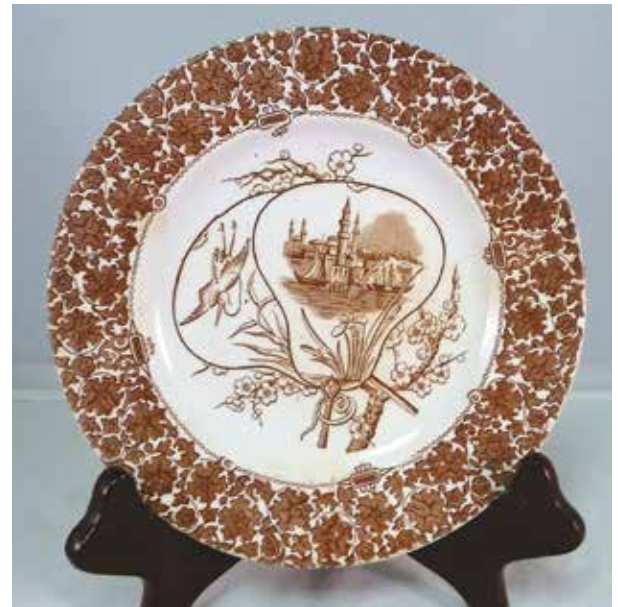
FIGURE 4: 6 1/2" Cairo plate.

own extensive collection of Japanese objects; from these objects, designers could gain inspiration.