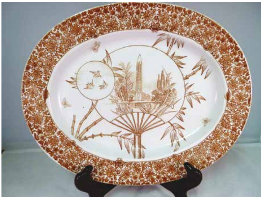
FIGURE 1: 13" Cairo platter.

Further support for this conclusion is the 1862 International Exhibition in London, where there was an official Japanese section. The Japanese Court was organized by Sir Rutherford Alcock who had been the British Minister in Edo from 1858-1864. The Japanese area of the exhibition also included, for public viewing, Alcock's