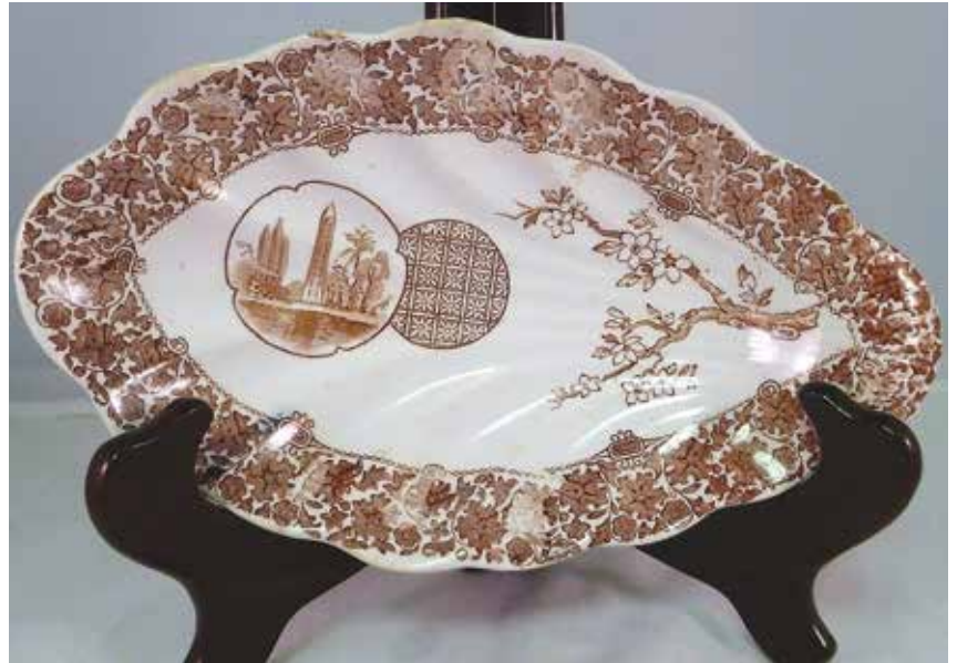
FIGURE 10: Cairo pickle dish.