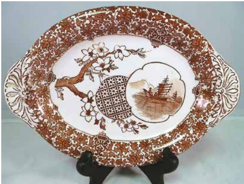
FIGURE 3: 8" Cairo tray.