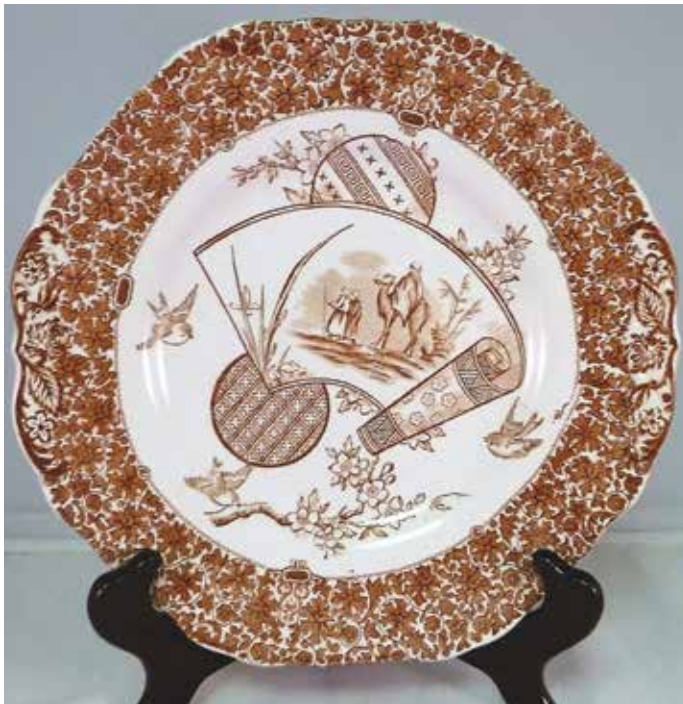
FIGURE 7: 10" Cairo cake or biscuit plate.

All of the above motifs are taken from items in my own collection. The following three motifs are found in Spode/Copeland Transfer-Printed Patterns by Lynne Sussman. The first motif (fig. 11) from the Sussman book is unusual in that it features a gourd as the prominent motif. Inside the top of the gourd are 3 flying birds as seen in other Cairo motifs, and in the bottom