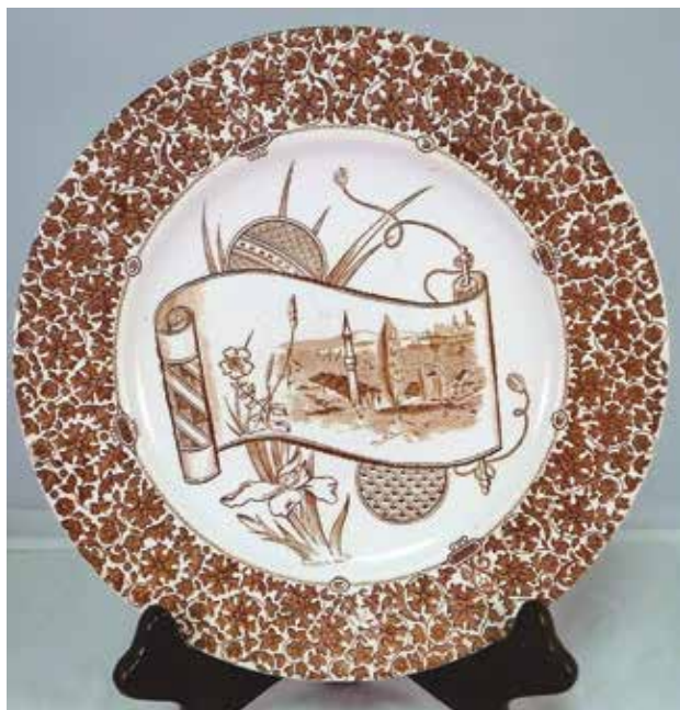
FIGURE 5: 7 1/2" Cairo plate.

On a 13" platter (fig. 1), an Egyptian obelisk is seen from across a river (the Nile, it is assumed). It is pictured in a fan cartouche layered on top of a ground of bamboo. A smaller round cartouche overlaps the fan and depicts 3 small birds in flight. This layering of elements with insets with their own images, along with the fan, the bamboo and the 3 flying birds, is very reminiscent of Japanese art. This lay-